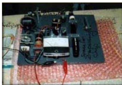
Fig. 2 Photonic Molecular Probe I.

Top view showing general configuration: dual paths; polarizer; analyzer; sample; and calibration mounts.