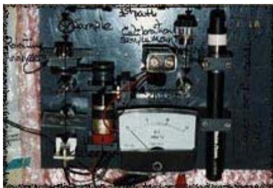
Fig. 1 Photonic Molecular Probe I.

Top view showing general configuration: dual paths; polarizer; analyzer; sample; and calibration mounts.