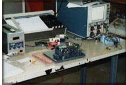
Fig. 3 Photonic Molecular Probe I.

Size perspective view of Photonic Molecular Probe sitting on lab bench.